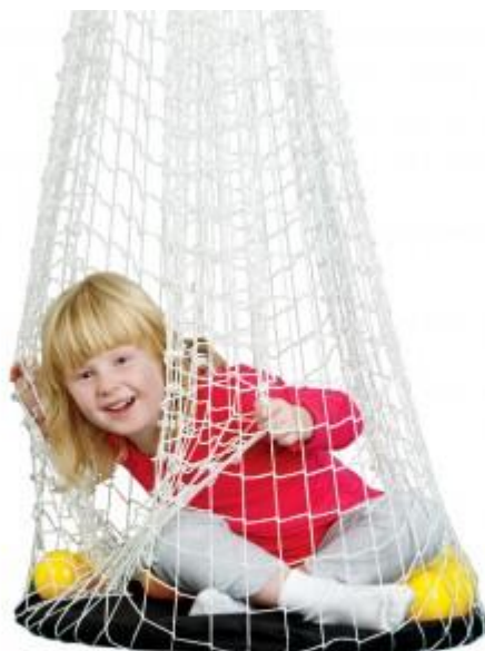
Shown with 21586 Accessory Board