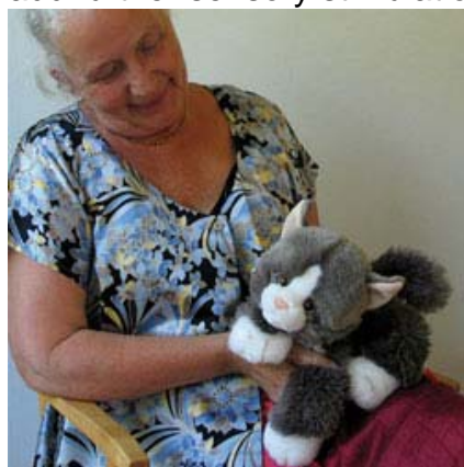
Empathy Cat 19924

The Heart is part of a range of 'Human Touch' accessories that compliment Empathy Dolls and Empathy Animals. The heart produces gentle vibrations, natural soft sounds and approximately 60 beats a minute. It can be placed in the recess of the following products to add further sensory stimulation to them: