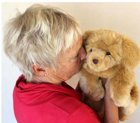
Empathy Dog 20562