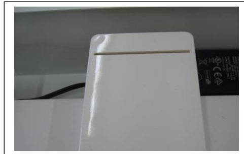
Aroma cartridge in position