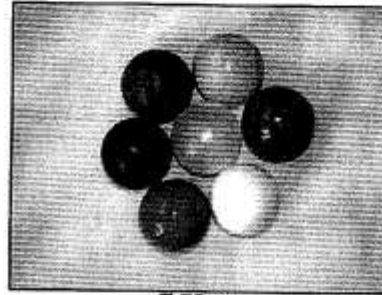
Ø 75mm 512306 nature 512308 white 512310 yellow 512311 orange 512313 red 512315 blue 512318 green