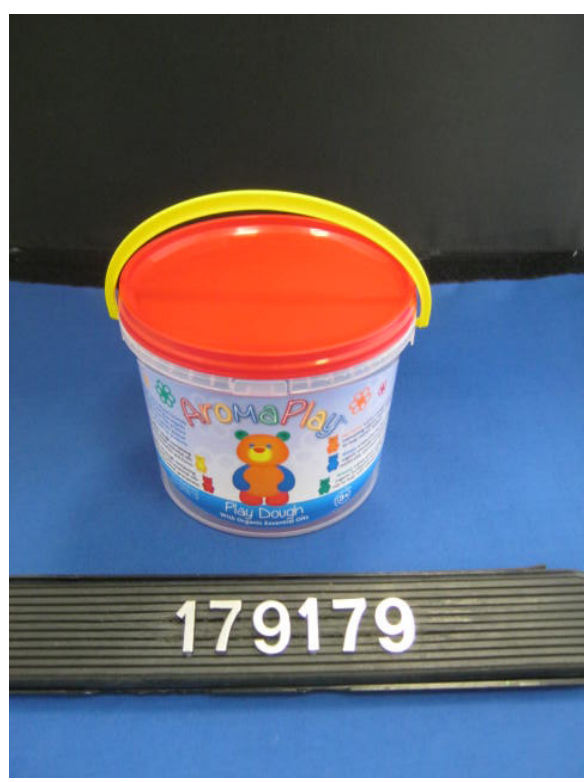
SGS authenticate photo on original report only